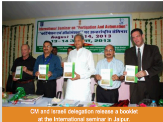
CM and Israeli delegation release a booklet at the International seminar in Jaipur.